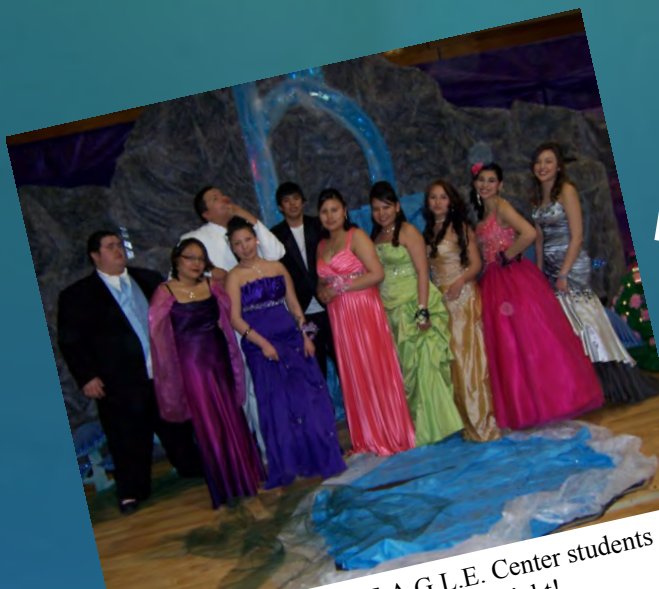
Some of our dazzling E.A.G.L.E. Center students at prom 2011: A Magic Night!