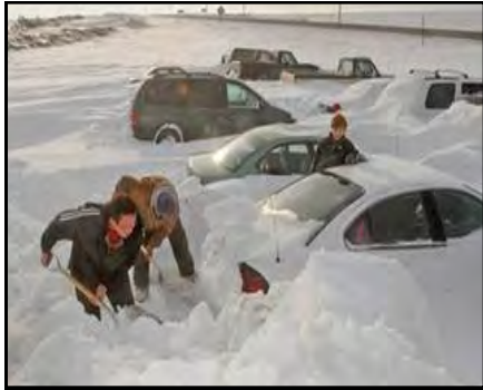
Digging out, from Topix.com

The blizzard hit us on January 22nd, but it didn't stop there—it broke some REA poles and made us lose power. Because of it, some people had to stay in emergency shelters and others left town. The blizzard was so bad, dang, I might just call it the great blizzard of 2010. The tribe had to call in the national guard and they had other electric companies help put up new poles and lines. Some people were kind enough to help deliver food and other supplies to people around town and other communities.