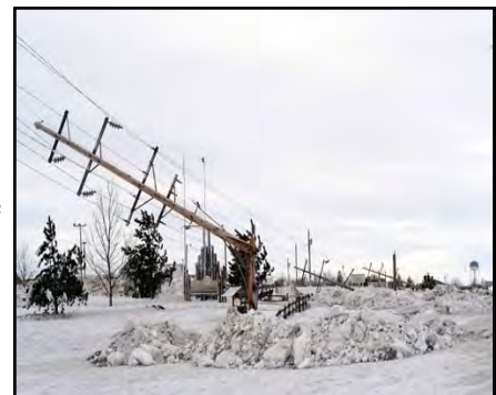
This was a familiar scene for travelers during the end of January.

When it was over, the town looked like a tornado